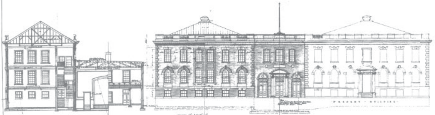
SECTION THRU CLASS ROOM